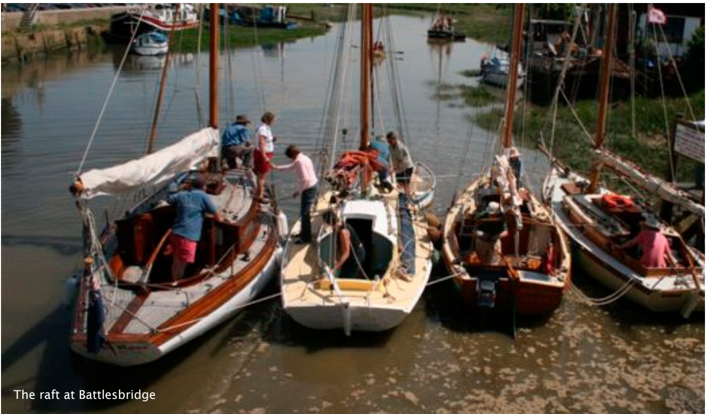
The raft at Battlesbridge