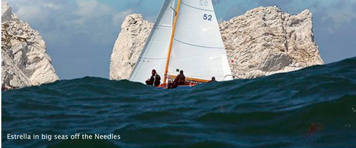
Estrella in big seas off the Needles