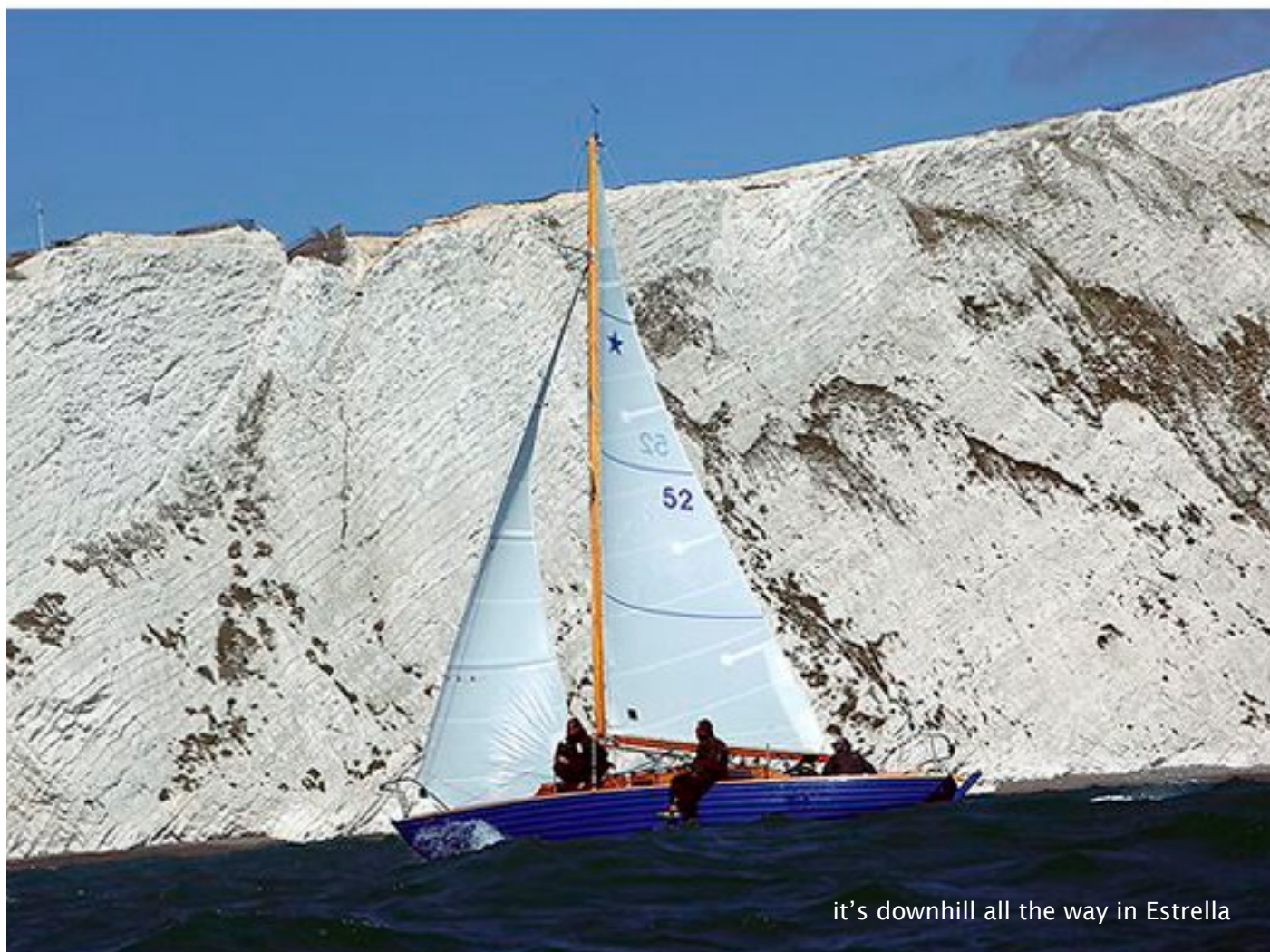
it's downhill all the way in Estrella

For the rest of the winter nothing much was said about the regatta and we pushed it onto the back burner. Fast forward to June '09 and the idea is brought back on the gas and planning takes place. Estrella's owner hands out various tasks to us crew, safe in the knowledge that we would be focused and respond with the requested information etc. Unfortunately crew fails to pull finger out and so Estrella's owner organises regatta entry/berthing etc – could this be the theme for the week? Anyway, before we know it we're strapping Estrella's mast on deck and leaving Ipswich Marina fully loaded with boat, wet weather gear and coffee. As it transpires, coffee was to play a major role in the week, as it was discovered that Pro Crewman does not respond to any known language until he has consumed at least two litres of strong, sweet