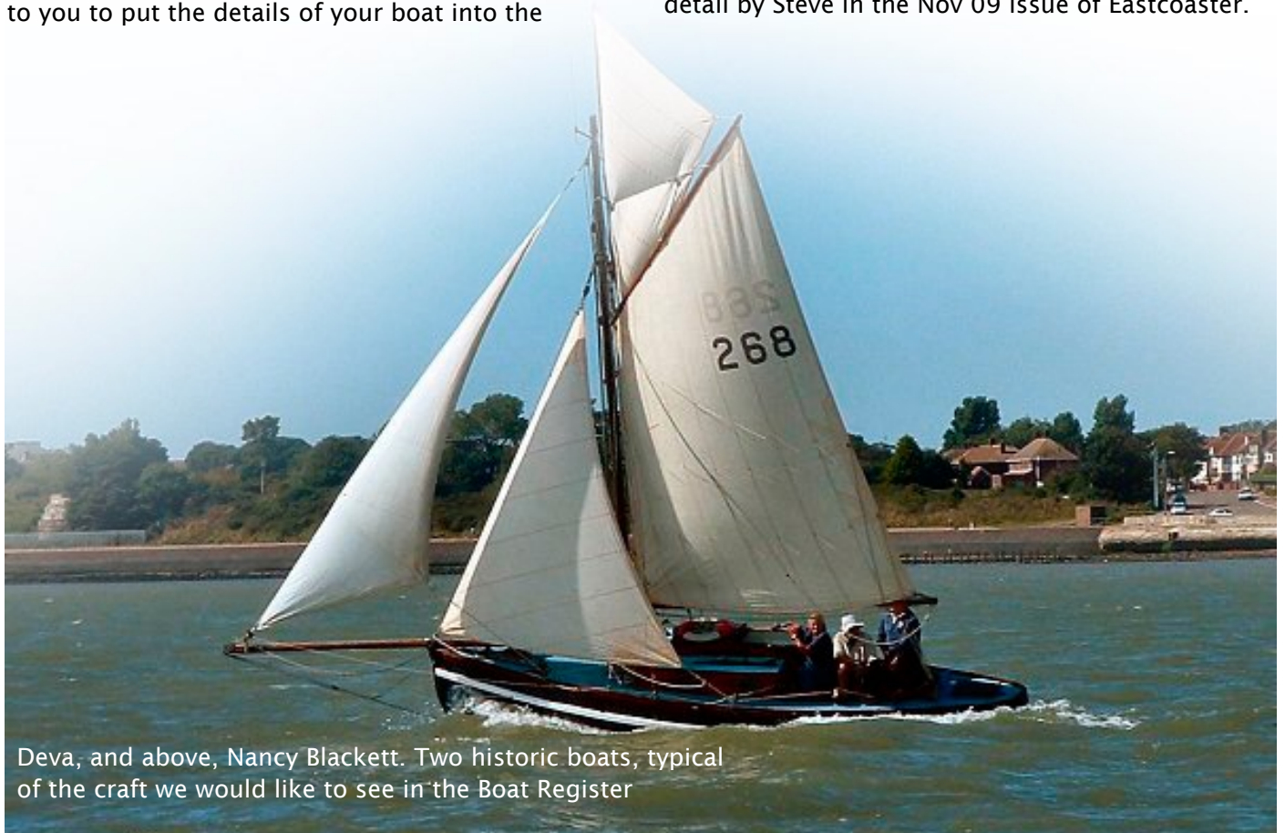
Deva, and above, Nancy Blackett. Two historic boats, typical of the craft we would like to see in the Boat Register