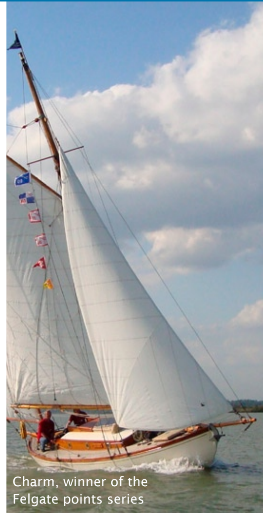
Charm, winner of the Felgate points series

This might be a good opportunity to remind members to send in entry forms for events in good time – at least a week before the event. While no one is ever turned away from an event because they haven't sent in an entry form – we need the money – it helps your hard working organisers no end if they know ahead of time who's coming. And to concentrate the mind, your committee has decided to levy a late entry fee of £5 on entries received on the day. End of sermon.