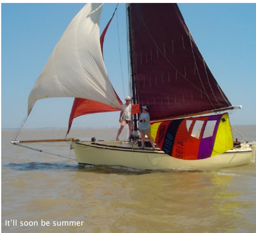
It'll soon be summer